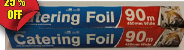
OF90000 Catering Foil** 450mm x 90m WAS €8.50 NOW €6.37 SAVING €2.13