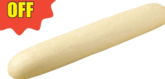
DF27531 Part Baked Panini (55x125g) WAS €19.30 NOW €12.95 Promo Unit Cost €0.23 SAVING €6.35