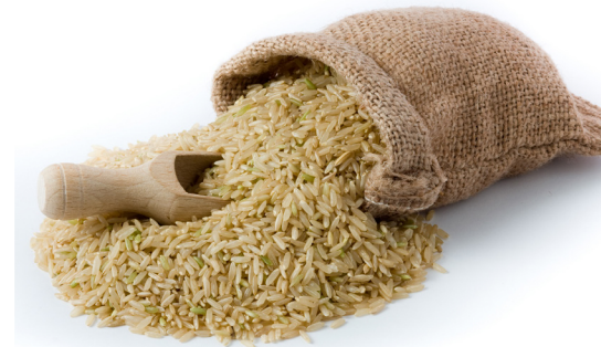
OF2090 L/G Brown Rice - Easy Cook (5kg) WAS €9.25 NOW €7.50 SAVING €1.75