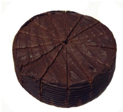
PR4000 Choc Fudge Cake* (14 portions) WAS €15.00 NOW €11.95 €0.85 per slice SAVING €3.05