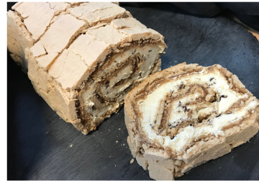
PR5053 Baileys & Choc Roulade (1 x 10 portions) WAS €10.90 NOW €10.00* SAVING €0.90