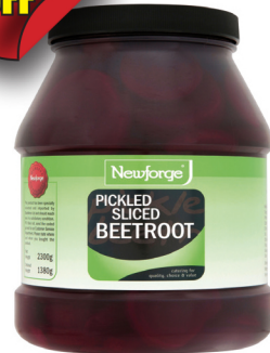
NF8113 Sliced Beetroot (2.25kg) WAS €5.50 NOW €4.95 SAVING €0.55