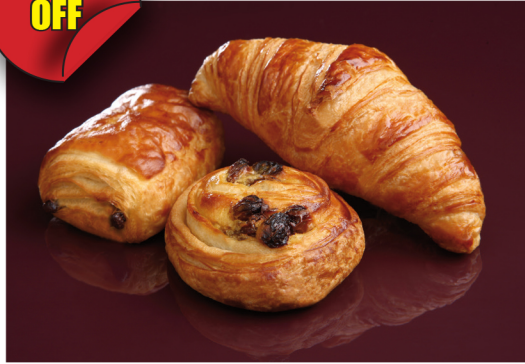
DF3000 Assorted Mini Mixed Danish (25-30g x 120) WAS €27.60 NOW €20.70* Promo Unit Cost €0.17 SAVING €6.90