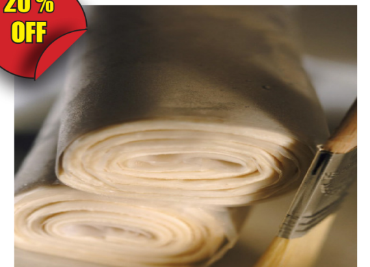
GBF01 Filo Pastry Sheets* (8 x 500g) WAS €22.80 NOW €18.24 SAVING €4.56