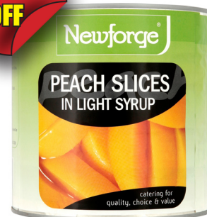
NF1020 Peach Slices in Light Syrup 6 x 2.6kg WAS €25.00 NOW €20.00 SAVING €5.00