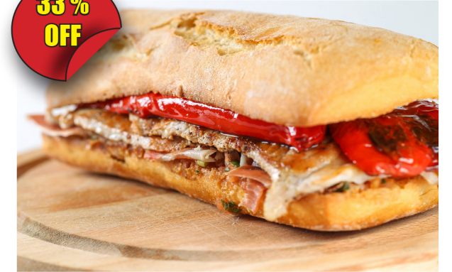
PA2000 Large Ciabatta Sliced (2x22x110g) WAS €21.70 NOW €14.50 Promo Unit Cost €0.33 SAVING €7.20