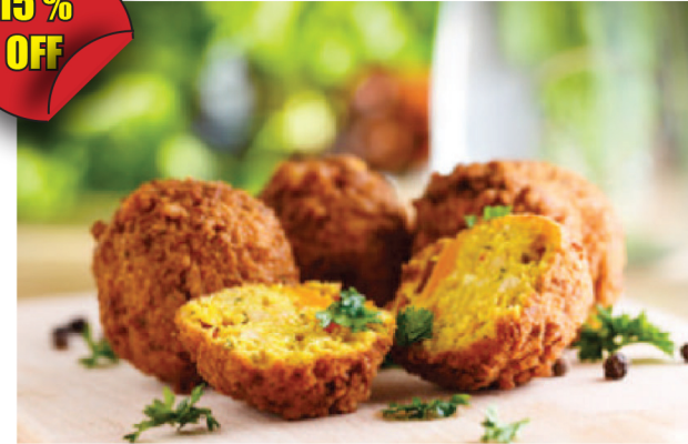
BF1004 Falafel ( Carrot & Coriander) (6x1kg) WAS €48.00 NOW €40.80 SAVING €7.20